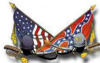
Pictured is the logo for the Drummer Boy Civil War Museum.