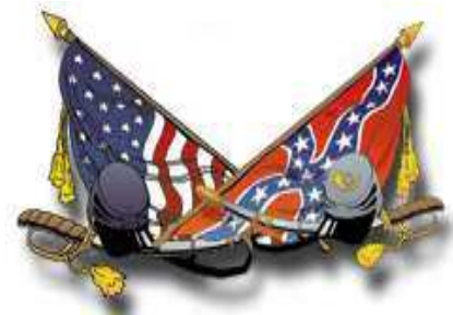
Pictured is the logo for the Drummer Boy Civil War Museum.