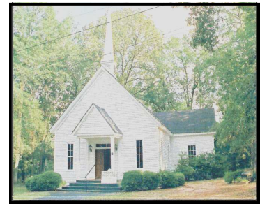
Pictured is the Andersonville Baptist Church building after exterior repairs and painting.